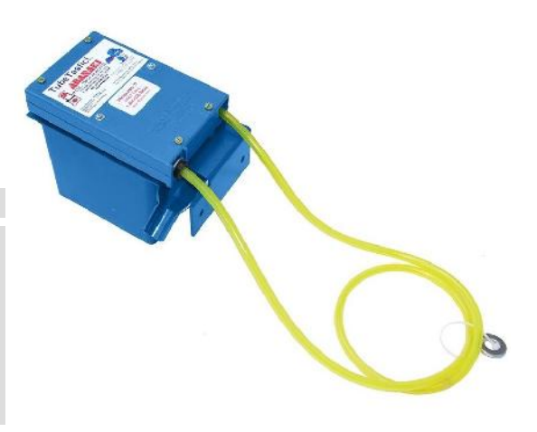
Tube Oil Skimmer STUBE01F